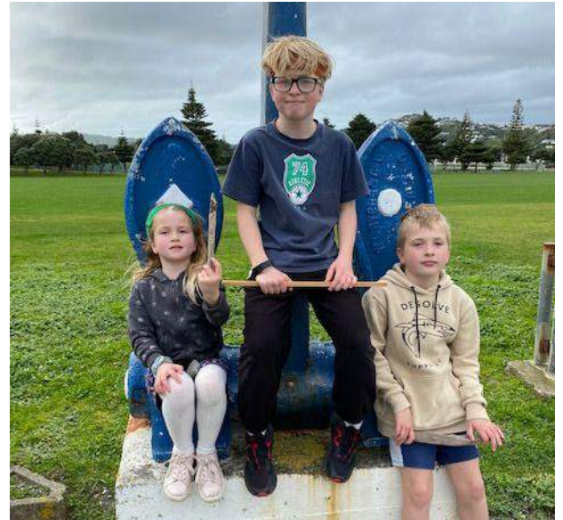
Fitness: The Evans family enjoying a walk.