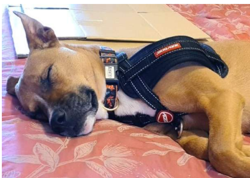
Bella's dog Lucy after Room 10's pet day on zoom