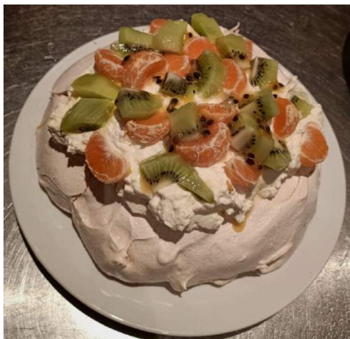
Food technology: Hope's yummy pav!