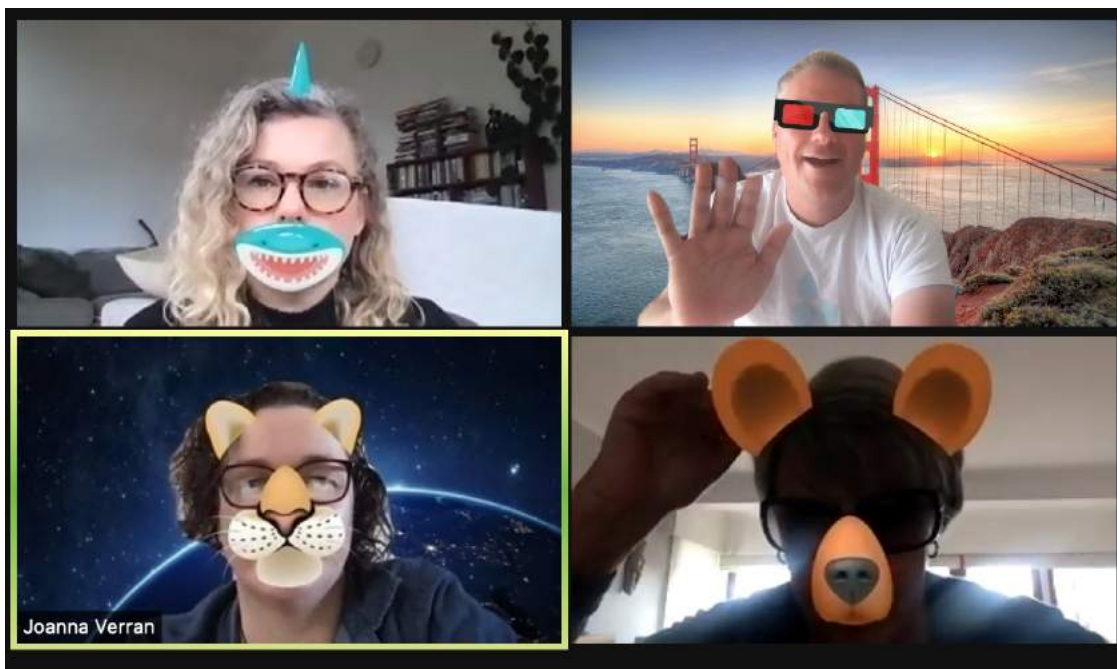
Taupo team meeting!