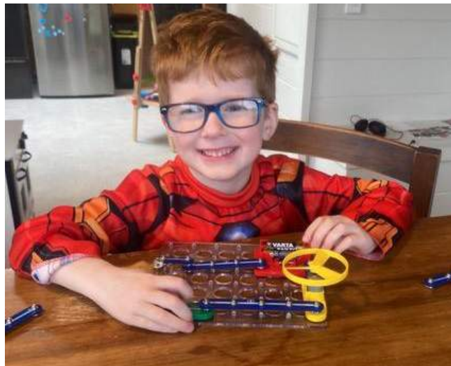
Technology: Mark making machines.