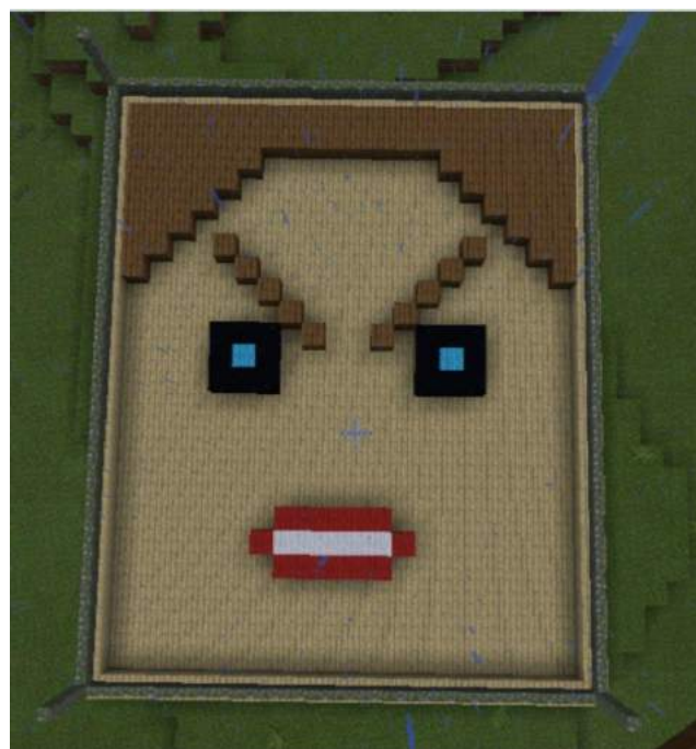
Digital technology: Tyler replicates a book cover in Minecraft