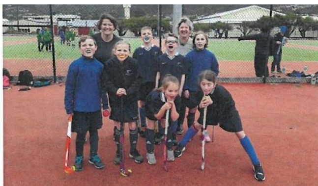
Plimmerton Thunder Hockey Team.