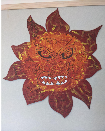
Te rā i te rangi - Rm 2