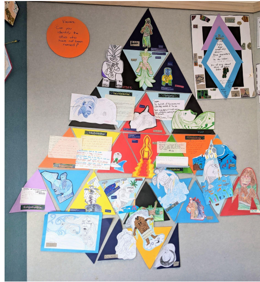
Atua - Rm 16

We have had a wide range of new books introduced to the library this term. I hope that your child has brought home some great books from the library to read over these holidays.