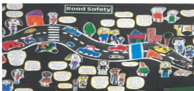
Room 9's Road Safety Mural